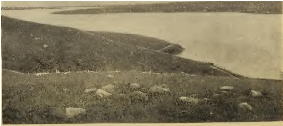
INDIAN GRAVES ON FORT HILL, MONTAUK